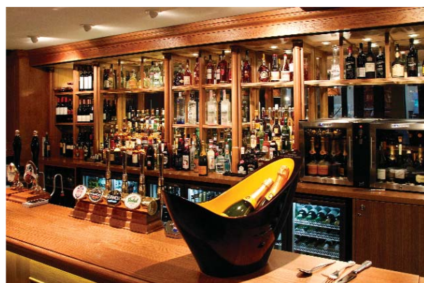
The Tudor Club Bar